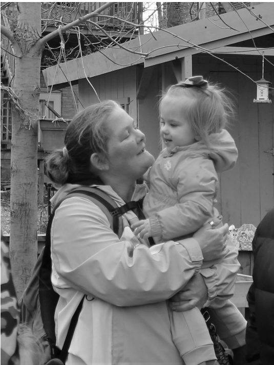
Easter Fun Creates Smiles

Pocket-Sized Farms registration forms were made available to parents of children aged 7 to 10, for this summer program, and parents were invited to participate in the Registered Education Savings Plan information forums.