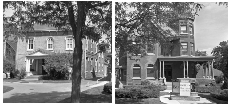
Life*Spin's first two locations on Queens Avenue

LIFE*SPIN's first home was located in the former manse of First Saint Andrew's United Church. We moved across the driveway to 360 Queens Ave, sharing our space with East London United Church Outreach and the Bethany Centre.