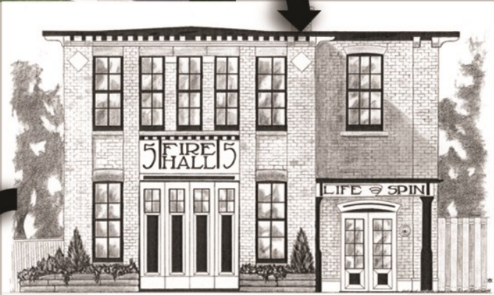
Fire Hall #5 1998-2005