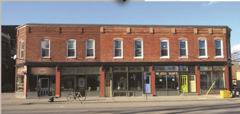
Current Location 2005-