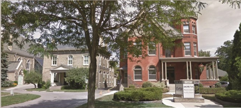
Queens Ave 1992-1998